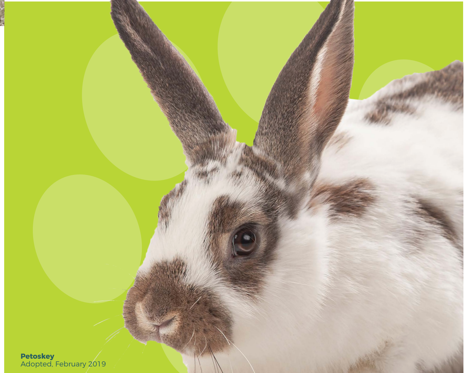
Petoskey Adopted, February 2019