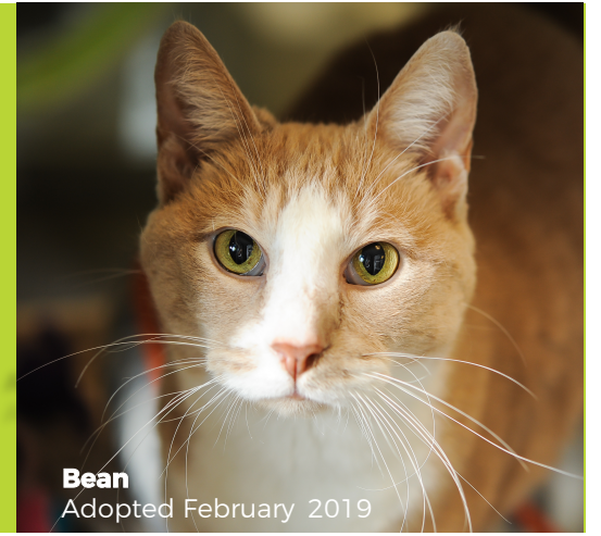
Bean Adopted February 2019

To build a more compassionate community where animals are given the care they deserve and to promote the humane treatment and responsible care of animals in West Michigan through education, example, placement, and protection.