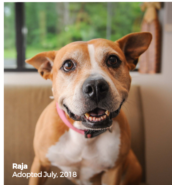
Raja Adopted July, 2018