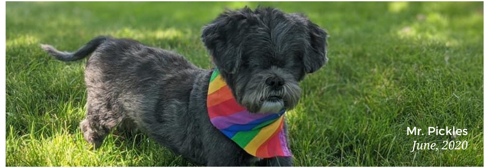
Mr. Pickles June, 2020