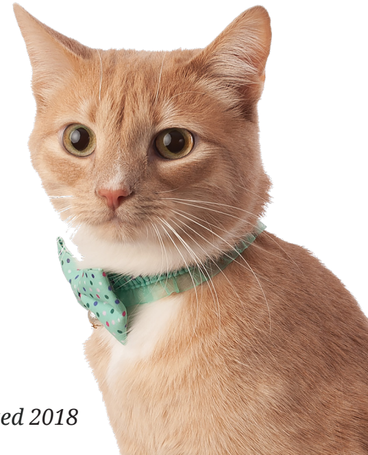
Linguini, adopted 2018