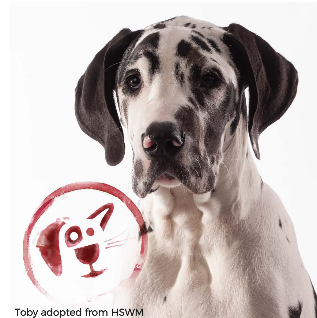
Toby adopted from HSWM

This beautiful girl was brought to Humane Society of West Michigan in March of 2018. Butterfly was timid at first and would only allow to be petted on her own terms. She needed the resources to find her perfect home, the comfiest couch, and a patient family. After several months and because of your support, Butterfly was able to find her forever home and is now able to relax and decompress on her own couch!