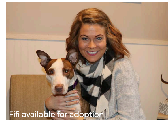
Fifi available for adoption