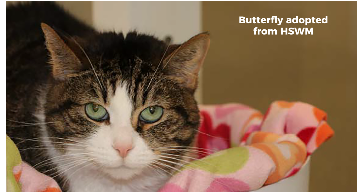
Butterfly adopted from HSWM